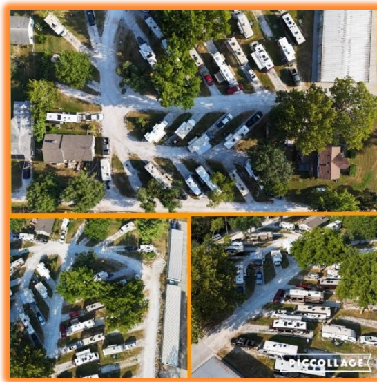
Cooks RV Park

The How Rolling Rally began in Springfield, MO at Cooks RV Park. We gathered for dinner at Ziggies Cafe. The food was very, very good and amazingly reasonable. Service was a 10.