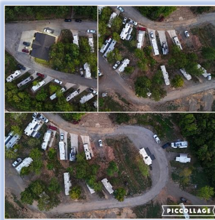
Big Pine RV Park

Pegs and Jokers and Hand and Foot cards rounded out the day.