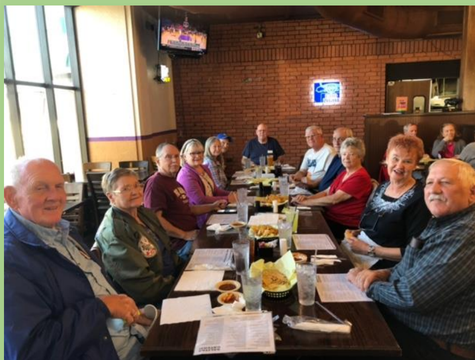
Early bird dinner at Salita's Mexican Restaurant